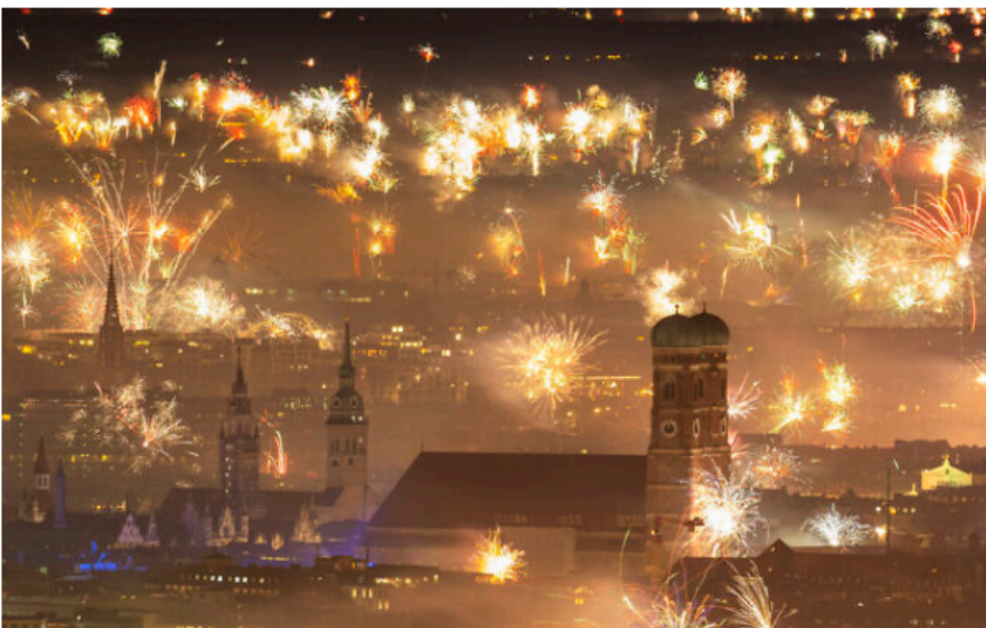
Fireworks light up the sky over Munich, Germany, Jan. 1, 2024.

fireworks launched simultaneously from multiple casinos. The city of Las Vegas said more than 400,000 people were expected at the celebration. German authorities said they detained three more people in connection with a reported threat of a New Year’s Eve attack by Islamic extremists on the world-famous Cologne Cathedral. In Berlin, some 4,500 police officers worked to keep order and avoid riots like those seen a year ago. They also banned a pro-Palestinian protest in the Neukoelln neighborhood of the German capital, which has seen several pro-Palestinian riots.