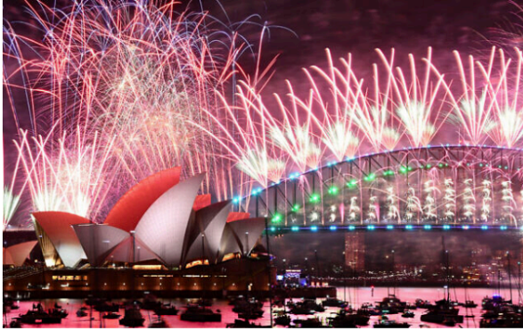
Fireworks explode over the Sydney Opera House and on the Harbour Bridge as part of New Year's Eve celebrations in Sydney, Monday, Jan. 1, 2024.